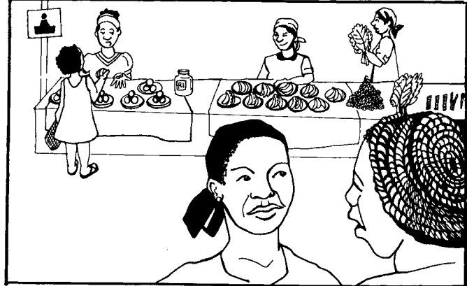
A good leader uses fair processes