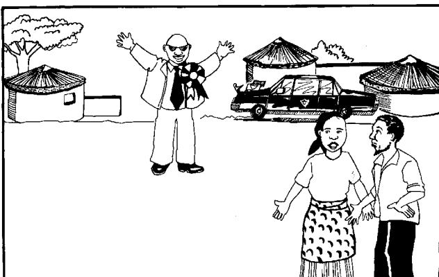
A good leader is in touch with the needs of the community