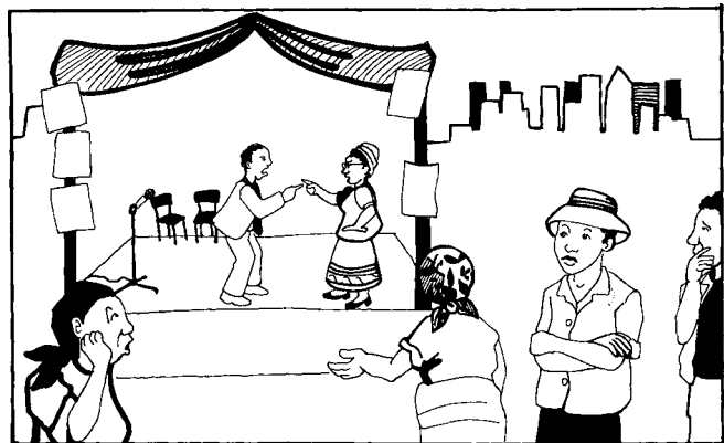
A good leader does not allow 'power struggles' to affect their leadership