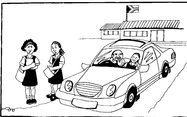
A good leader does not use their status to exploit people